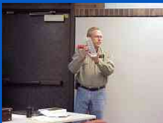
WB8R with Newsletter Award Plaque