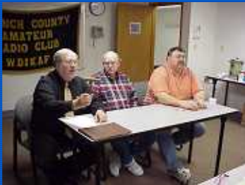
Liar's Club Panelists