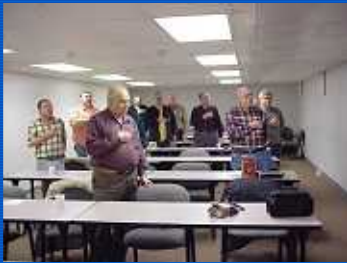
Pledge of Allegiance