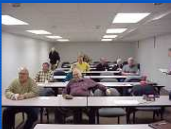
Relaxation after Liar's Club winners were determined