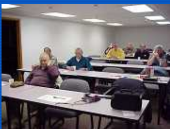
Deep in Thought during Liar's Club Program