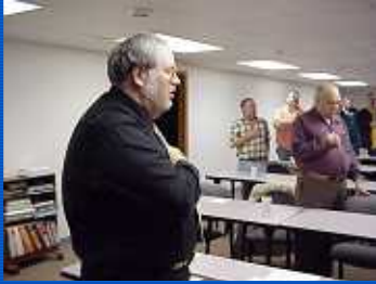
W8SST Leads Club in Pledge of Allegiance