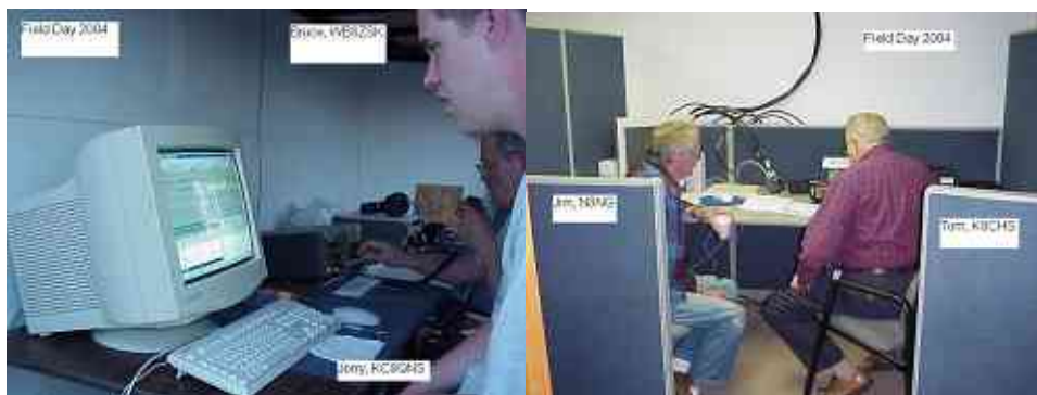
2004 Field Day

The topic for the meeting will be Field Day. We will be showing video and slide presentations of Field Days past and will be discussing plans for this year's event which will be held on June 25 and 26.