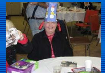
Who says our parties are boring?