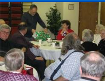
Arnie opening a package