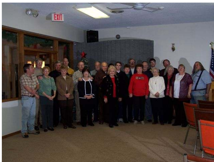
2005 Christmas Meeting Attendees

Our annual Gift Exchange was a popular activity at the Christmas meeting. The gifts were very nice and there was plenty of 'gift grabbing' that adds excitement to the exchange. All in all, everyone who brought a gift went home with a useful item to add to their collection of 'stuff' in their shacks. Thanks to all who participated in the dinner and gift exchange.