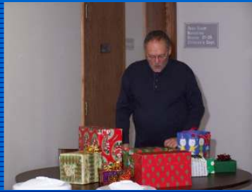
NS8T looking 'em over