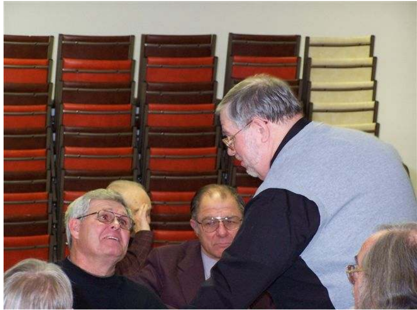
W8SST on the Prowl