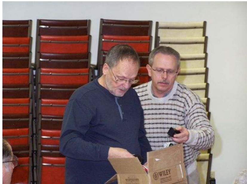
NS8T gets some (much needed) help from WB8R