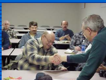
KC8PWB receives Certificate

MAURITANIA, 5T. Jean, 5T0JL is normally QRV using CW on 80 meters after 0400z. QSL via ON8RA.