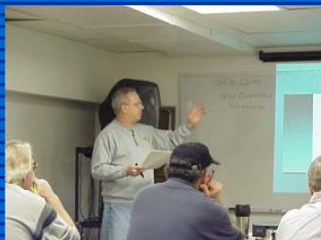
With a wave of the hand it will all go away...