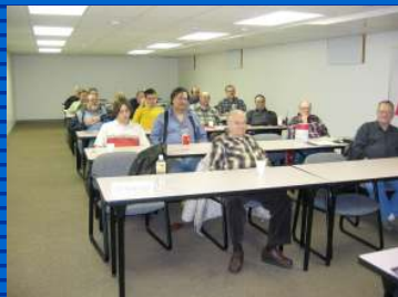
January Meeting Attendees