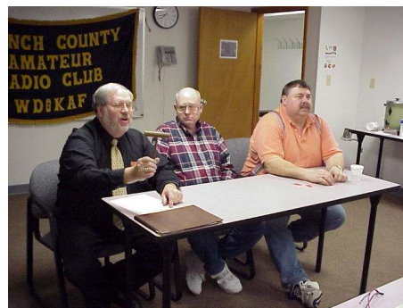
Our distinguished panel of Liars in Feb, 2005

We can guarantee lots of laughs as you watch the panel perform for you. The person who can see through the smoke best will win a prize.