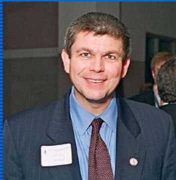
US Rep Mike Ross, WD5DVR, (D-AR)