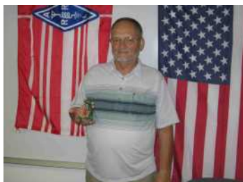
NS8T Showing off his new Fox Figurine

Fox Hunt August 15, 7:00 PM at the 911 Center Parking Lot.