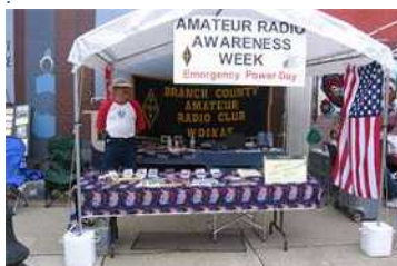
WB8ZSK ready for Visitors!