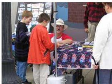
Youngsters try out Morse Code