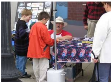
Youngsters try out Morse Code