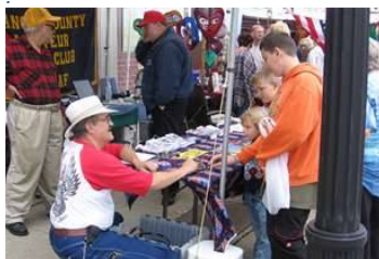
WB8ZSK workin' the crowd!

We will make a major push to recruit students for our upcoming licensing class and hope to create significant interest in the class and ham radio in general. Please stop by and say hello.