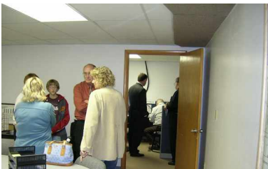
Guests at Station Dedication