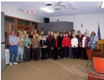
2005 Christmas Dinner Guests