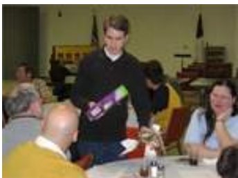
K8SST trolling for good gifts