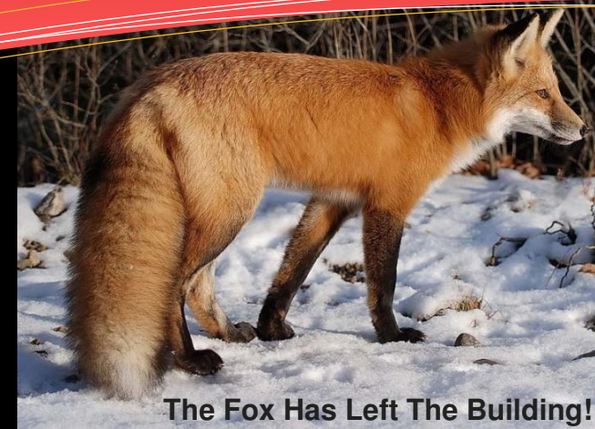
The Fox Has Left The Building!

Larry Camp, WB8R 517.278.0406 wb8r@arrl.net